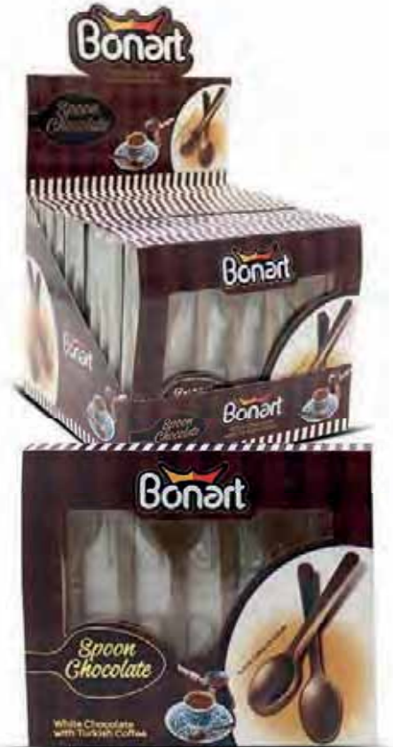
2339 Turkish Coffee Chocolate