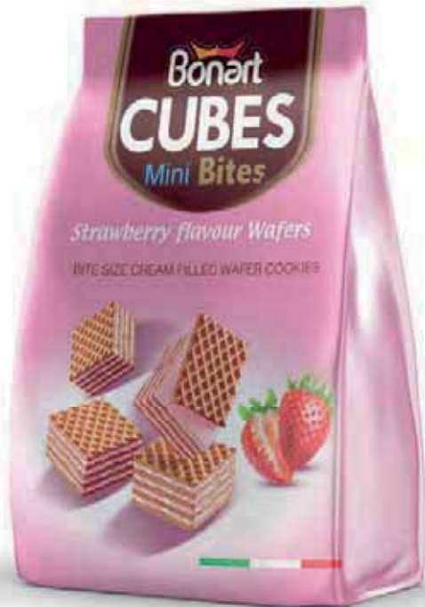
9241 CUBES BITE SIZE WAFFER WITH STRAWBERRY CREAM