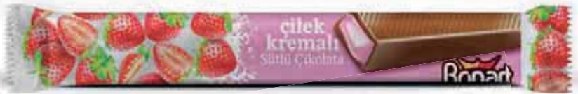
2598 BONART STICK MILK CHOCOLATE FILLED WITH STRAWBERRY CREAM