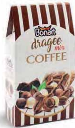
1515 Dragee Assorted Choc. Coffee bean