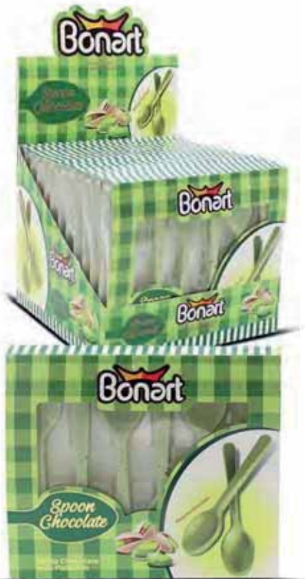
2338 Pistachio Chocolate