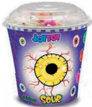
3076 EYES SOUR LOLLIPOP