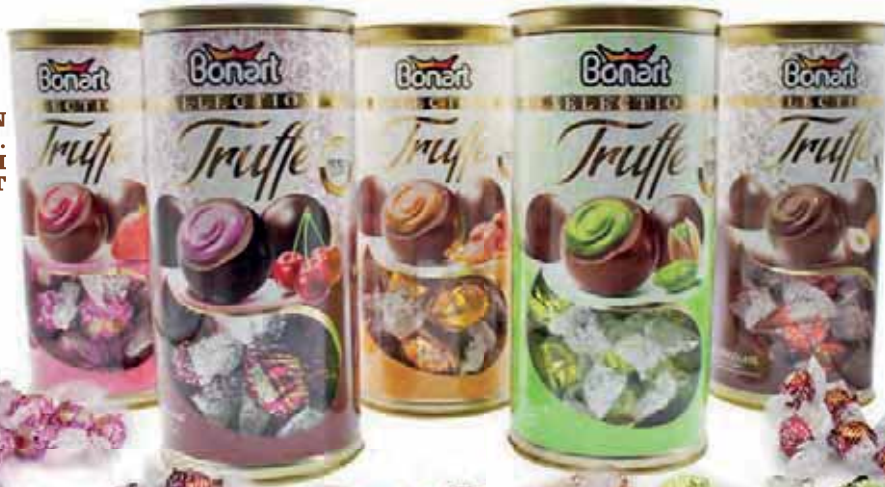
3102 BONART SELECTION TRUFFE MILK CHOC. WITH HAZELNUT CREAM PET