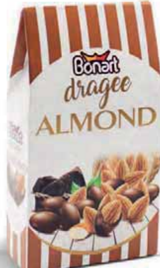
1336 Dragee Milk Choc. Almond