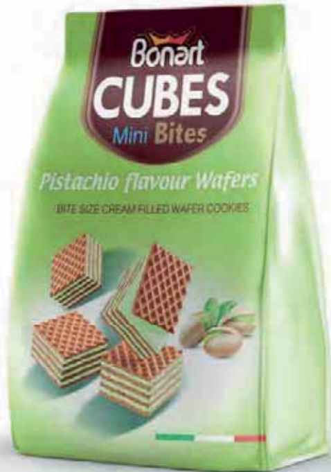
9239 CUBES BITE SIZE WAFFER WITH PISTACHIO CREAM