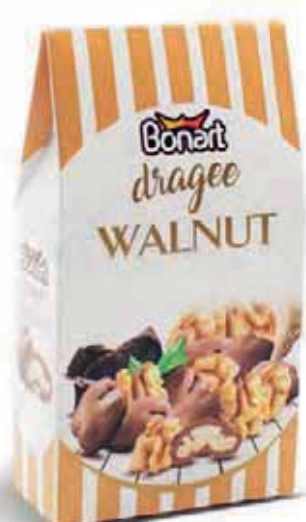
1517 Dragee Milk Choc. Walnut