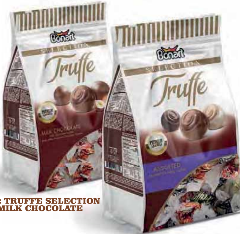
8682 TRUFFE SELECTION MILK CHOCOLATE