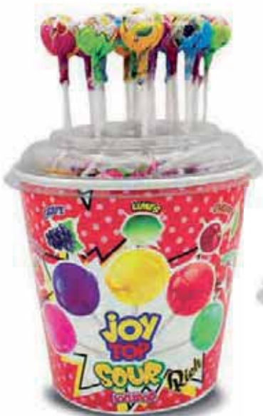
2387 SOUR CH LOLLIPOP