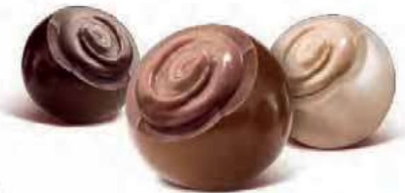
8685 TRUFFE SELECTION ASSORTED