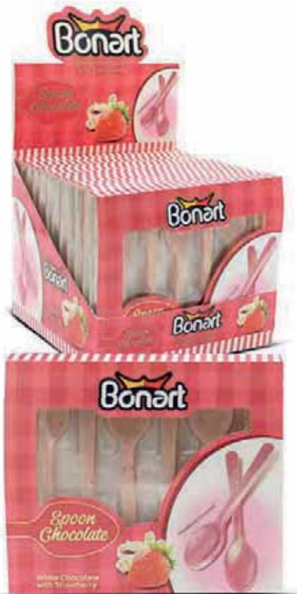
2337 Strawberry Chocolate