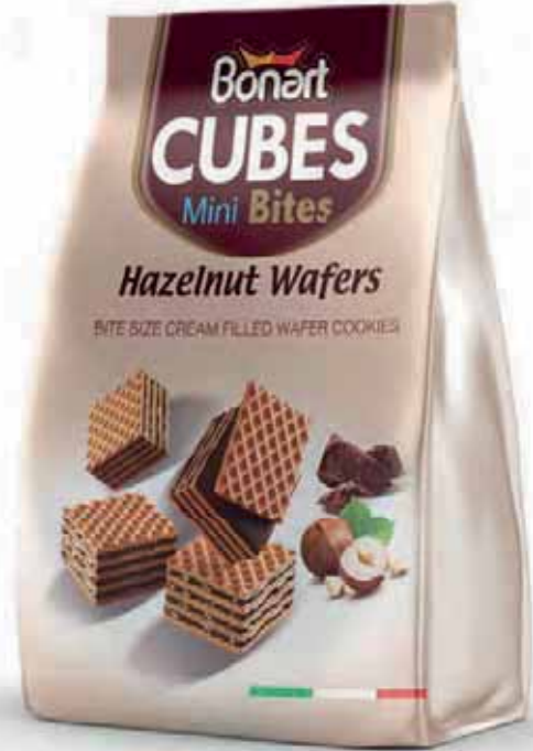
9240 CUBES BITE SIZE WAFFER WITH HAZELNUT CREAM