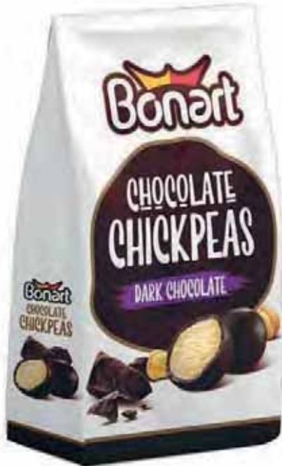
2334 CHOCOPEAS DARK CHOCOLATE CHICKPEAS