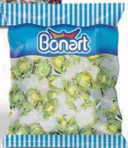
1958 SELECTION TRUFFE MILK CHOCOLATE PISTACHIO CREAM