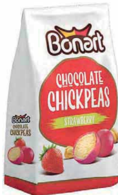
2335 CHOCOPEAS STRAWBERRY FLV. WHITE CHOCOLATE CHICKPEAS