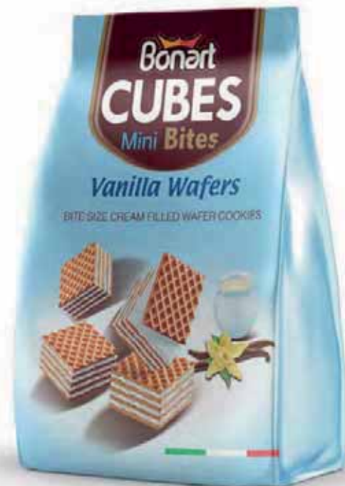
9242 CUBES BITE SIZE WAFFER WITH VANILLA CREAM