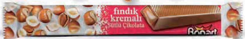
2596 BONART STICK MILK CHOCOLATE FILLED WITH HAZELNUT CREAM