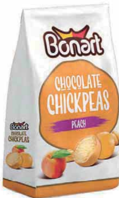
2336 CHOCOPEAS PEACH FLV. WHITE CHOCOLATE CHICKPEAS