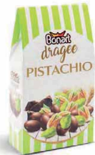
1354 Dragee Milk Choc. Pistachio