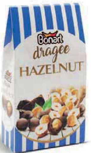
1355 Dragee Milk Choc. Hazelnut