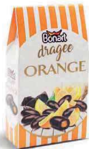
1356 Dragee Dark Choc. Orange