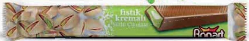
2597 BONART STICK MILK CHOCOLATE FILLED WITH PISTACHIO CREAM