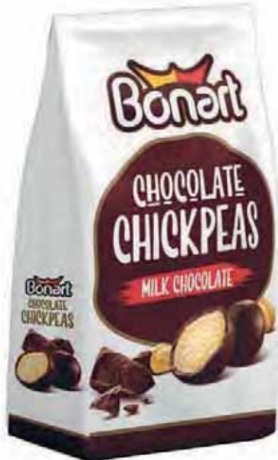
2332 CHOCOPEAS MILK CHOCOLATE CHICKPEAS