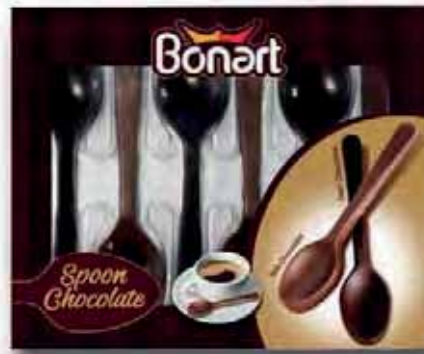
1734 SPOON CHOCOLATE MILK AND DARK CHOCOLATE